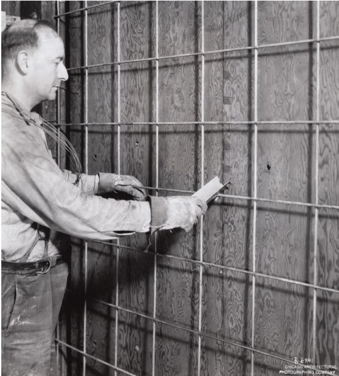
A photo from the WRI Historic Archives (Chicago Architectural Photographing, R-6891, July 1932): “wall mesh, 66-00”.

While modern WWR nomenclature is predicated on providing an easily recognizable reference to the steel area of the wire instead of the wire gage, the arrangement of the WWR style is nearly identical to the historic sequence of information, with perhaps the only other difference being separating punctuation for added clarity. The previously noted historic WWR style would look something like what is shown below when transformed into the modern format.